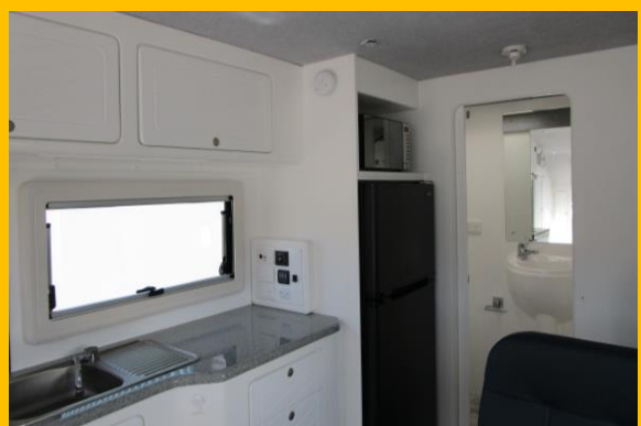
Large 2 Door Fridge Freezer