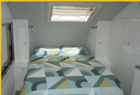
Island Double Bed