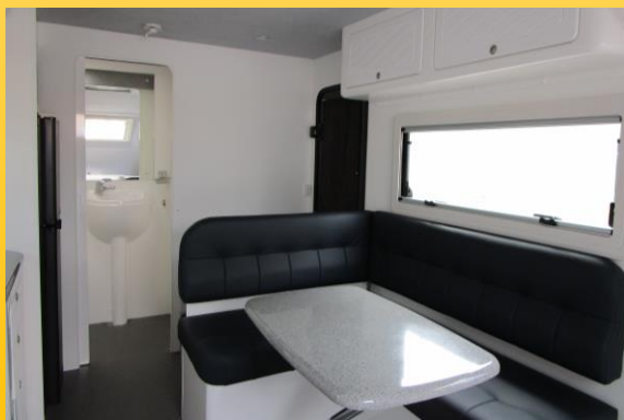
L Shape Seating